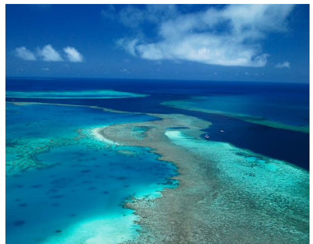
Hardy Reef – Great Barrier Reef

Blackout dates: The Great Barrier Reef Adventure package is not available over the dates 22 December 2017 – 6 January 2018 inclusive. Additional charges will apply for extra guests and/or extra bedding. The above package rates are applicable for persons aged 13+ years. Rates for additional persons 0-12 years inclusive are available on request