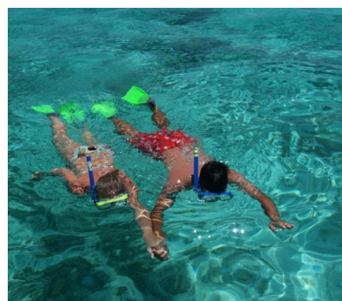
Snorkelling the Great Barrier Reef