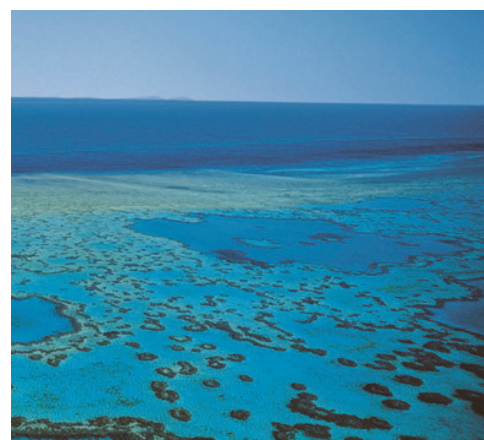
Aerial View – Great Barrier Reef

For reservations call 137 333 (within Australia) or (+61) 2 9433 0444 (outside Australia), email: vacation@hamiltonisland.com.au or visit www.hamiltonisland.com.au