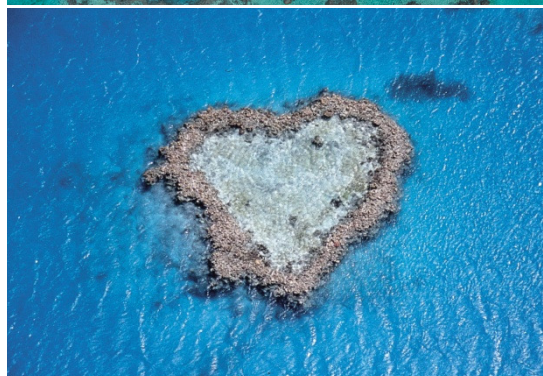
Heart Reef— Great Barrier Reef

Additional charges will apply for extra guests and/or bedding. The above rates are applicable for persons aged 13+ years. Guests must be certified divers and present dive card at the Explore Group office the day before the tour. Package not suitable for beginner/introductory dives. Blackout dates: The Reef Dive Experience package is not available over the dates 22 December 2017 – 6 January 2018 inclusive.