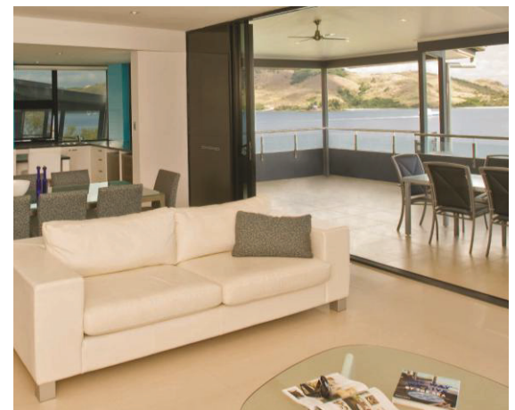
3 Bedroom Deluxe