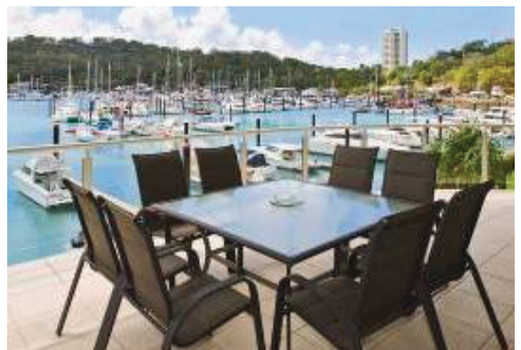
3 Bedroom Luxury